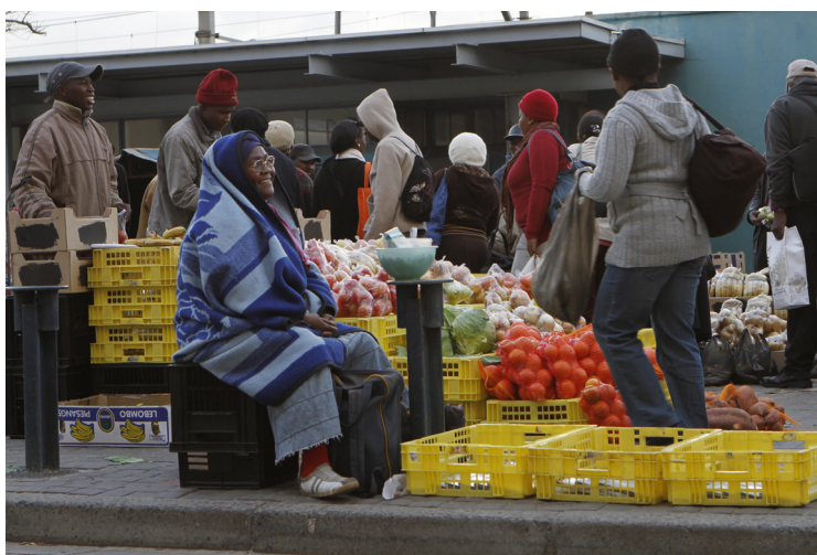
Wynberg, Cape Town, South Africa.

Supermarkets in Southern Africa have undergone significant growth in recent years. Some countries continue to import large amounts of food and related products into stores. At the same time, local suppliers in the region face challenges in becoming supermarket suppliers. Their entry into supermarkets holds potential for exporting and, as such, would encourage regional growth.