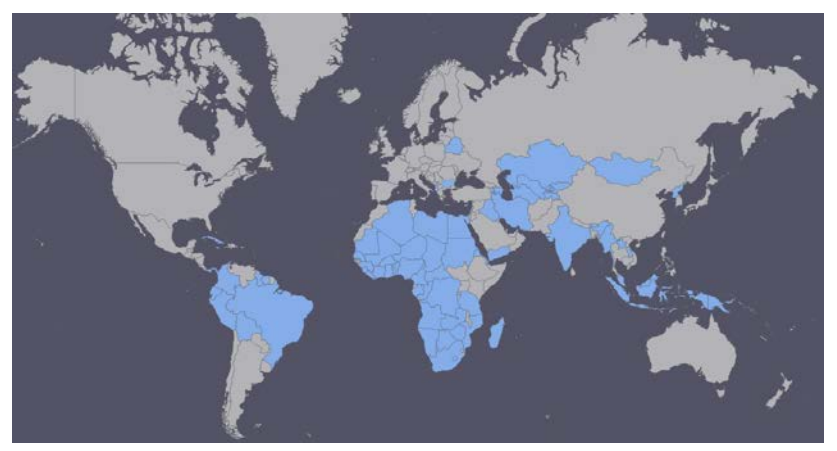
Figure 3: Export dependence on extractive industries

Note: darker shading indicates a country where the extractives sector accounts for 30% or more of total export earnings.