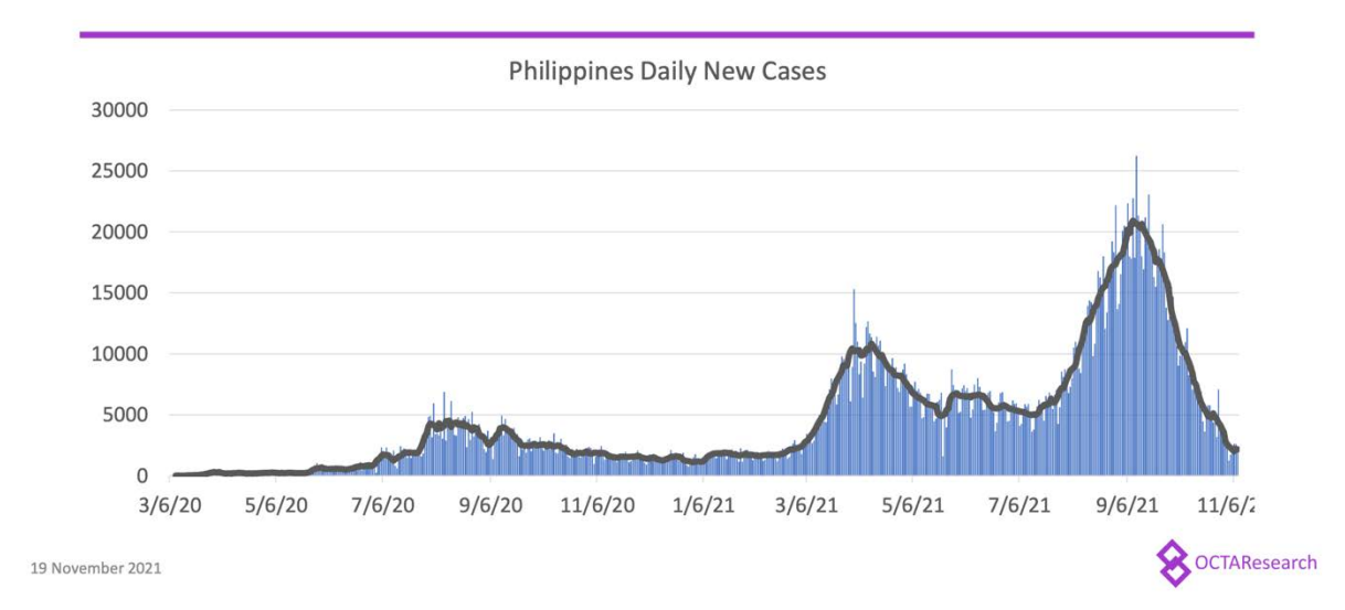
Figure 4: Surges of COVID-19 in the Philippines

4,300 daily cases in late August. The third wave peaked at 11,000 daily instances on average in mid-April 2021. The fourth wave, fuelled by the Delta variation, was the most devastating since the epidemic began. By 8 August 2021, the daily average had risen to nearly 19,000 instances (Cristino 2021). By September, the Philippines has breached two million cases, with a total death toll of 33,533 (Magsambol 2021).