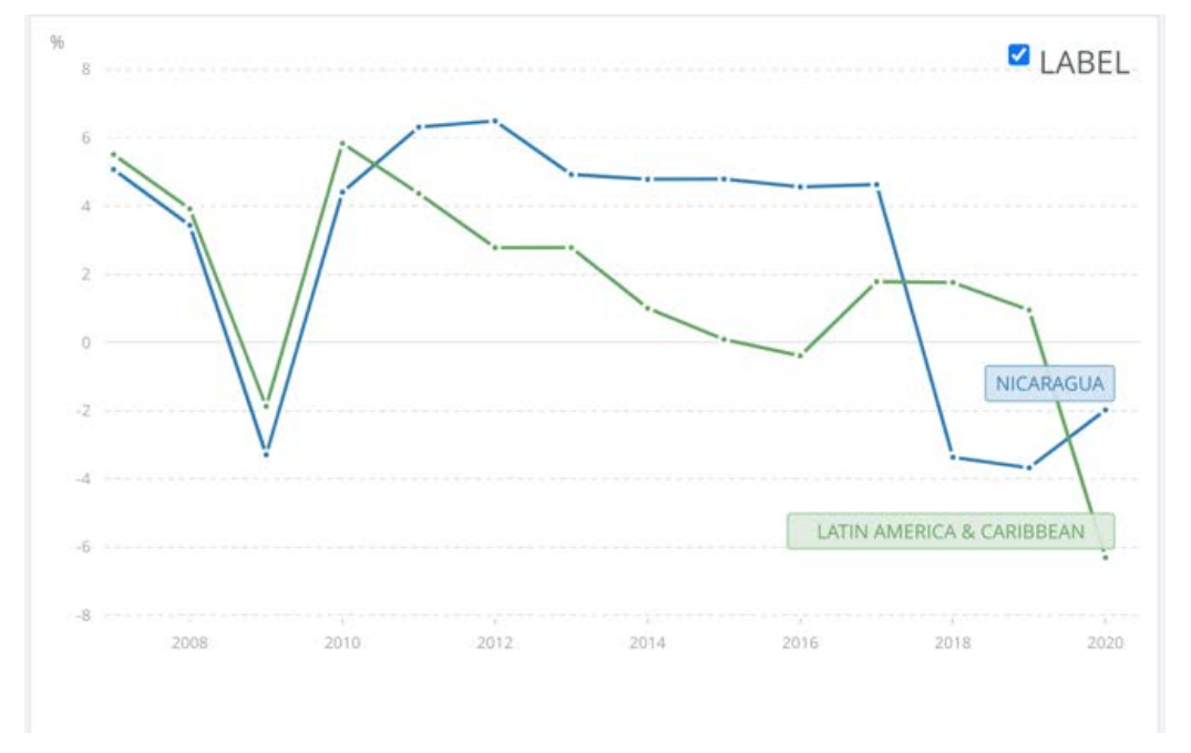
Figure 1: GDP growth (annual %), Nicaragua vs Latin America and Caribbean, 2008–20

19 pandemic in 2020, such that the recession caused by the 2018 political crisis no longer looks out of place in the wider regional panorama. However, questions remain about the role that pandemic-related policies played in this outcome; some recent research, for example, casts doubt on the health–economy binary upon which Nicaragua premised its decision against lockdowns (McKee and Stuckler 2020). Economist Abelardo Medina has suggested that Nicaragua 'leveraged the advantage that other countries were closed' in order to boost agricultural and manufacturing exports (Cota 2021).<sup>4</sup> Future research will have to consider whether or not the decision to keep the economy open was a good investment in terms of GDP growth or productivity in the long run. And, as Medina notes, any potential economic benefits must be measured against the human cost