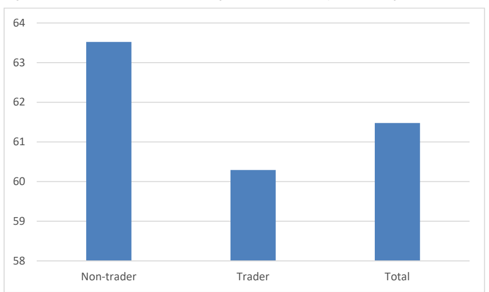
Figure 1: Female income as a percentage of male income by firm trading status

Figure 1 shows women's income as a percentage of men's income for manufacturing firms in South Africa across trading types. On average, women's wages are equal to only 61 per cent of men's wages, which puts the unconditional GWG at 39 per cent. Trading firms have a more unequal income distribution between genders, with women earning only 60 per cent of what men earn. In non-trading firms, women earn 64 per cent of what men earn. Thus, trading firms increase South Africa's manufacturing GWG by four percentage points, or about 11 per cent.