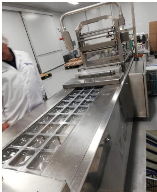
Examples of equipment in dairy processing from CCRED fieldwork