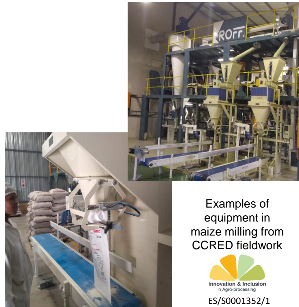
Examples of equipment in maize milling from CCRED fieldwork