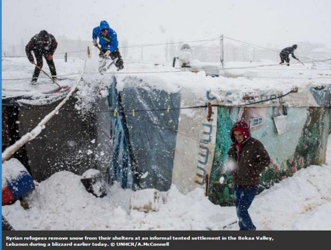
Syrian refugees remove snow from their shelters at an informal tented settlement in the Bekaa Valley, Lebanon during a blizzard earlier today.