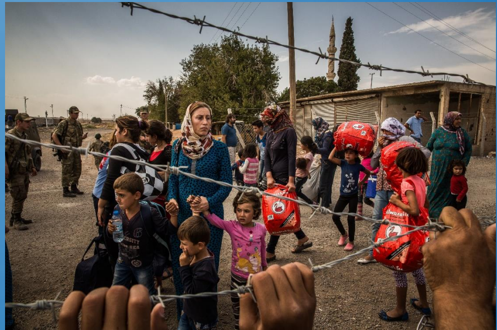
Women and children from Syria at a Turkish military checkpoint