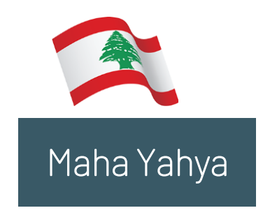
FDL/ERF sponsored Commission